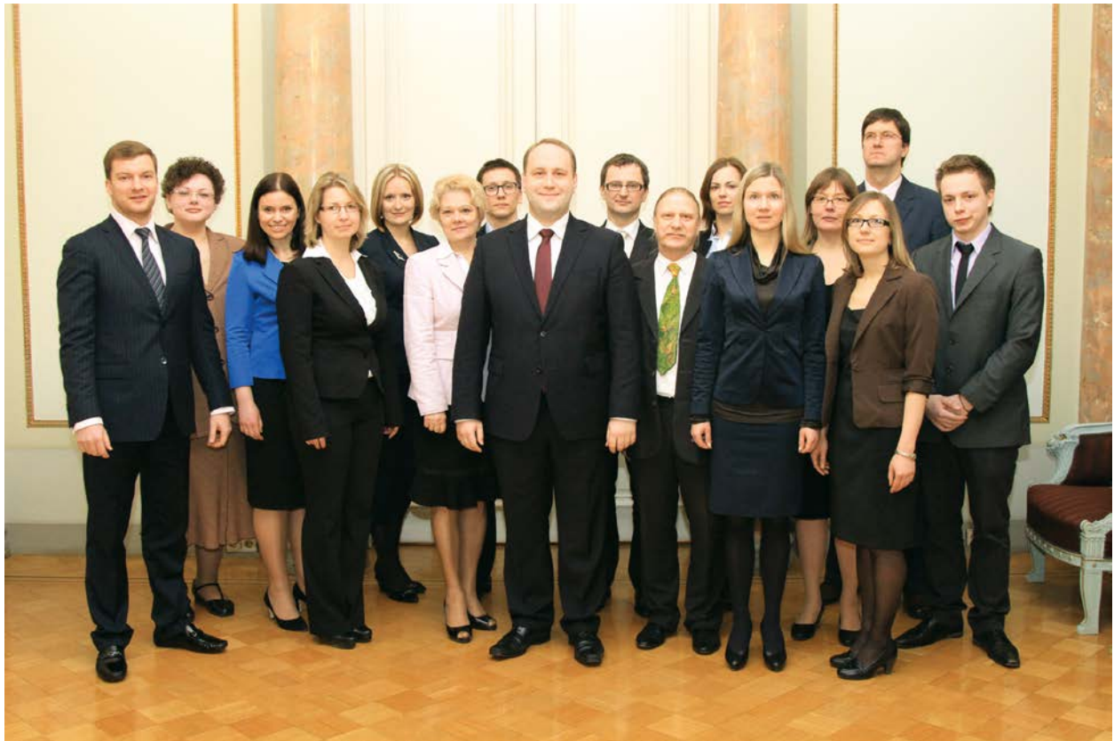
STAFF OF THE CROSS-SECTORAL COORDINATION CENTRE

The Cross-Sectoral Coordination Centre (CSCC) was established on December 1, 2011 and currently has 15 employees. As a newcomer to the public administration of Latvia, the CSCC proves its value through actions.